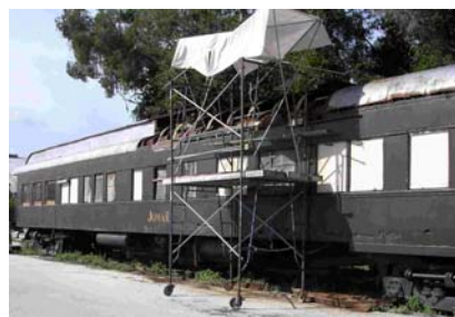
JOMAR, a work in progress